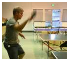
TABLE TENNIS OPEN PLAY RESERVATIONS NEW!

Open Play but in a new way! Reserve your spot today!